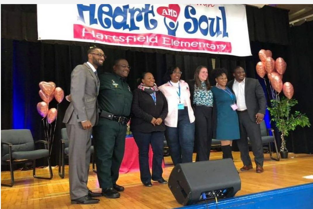
Panel Participants answer questions from parents at Hartsfield Elementary

I am truly honored to be a part of such a