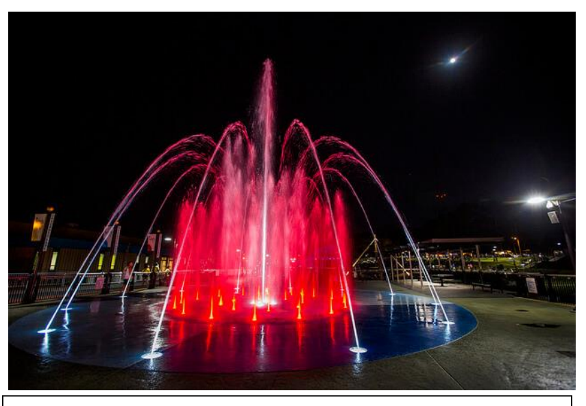
Imagination Fountain Shows at Cascades Park When: Evening Fountain Shows: Every Friday, Saturday, & Sunday 8:00 - 9:30 p.m., every 15 min

Area businesses and community organizations will be providing children's hands-on activities. There will be games, arts and crafts, and bouncers.